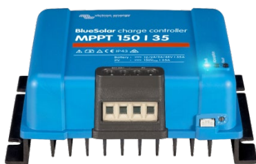
Solar Charge Controller MPPT 150/35